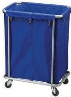
SEMS S411 LENIN TROLLEY