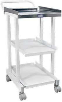
SEMS S401 ECG TROLLEY