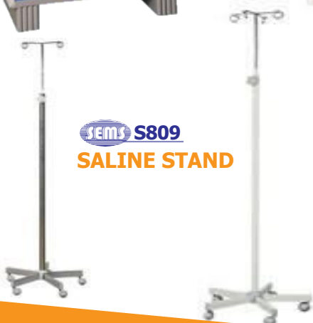
SEMS S809 SALINE STAND