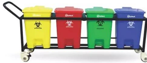
SEMS S412 DRUM TROLLEY