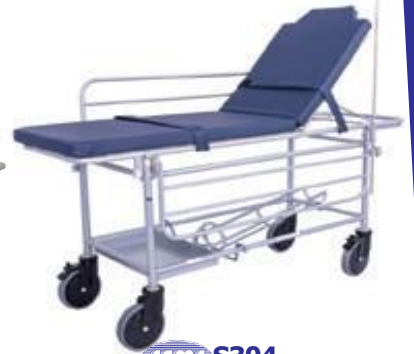
SEMS S304 STRETCHER ON TROLLEY (BACKREST ADJUSTABLE)