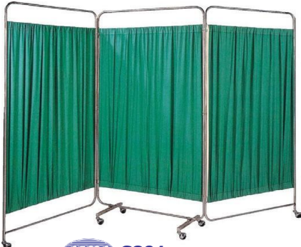
SEMS S801 BED SIDE SCREEN