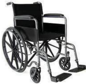
SEMS S806 WHEEL CHAIR