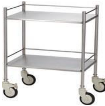
SEMS S402 INSTRUMENT TROLLEY