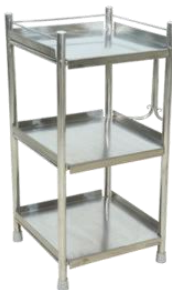
SEMS S502 3-TOP LOCKER