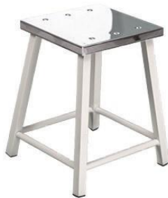
SEMS S602 ATTENDANT STOOL