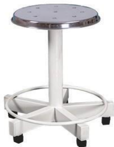
SEMS S601 REVOLVING STOOL