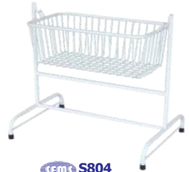
SEMS S804 BABY CRADLE