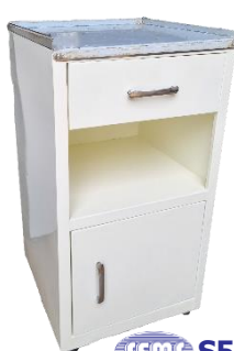
SEMS S503 DELUX LOCKER (S.S. TOP)