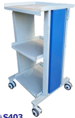
SEMS S403 Defibrillator TROLLEY