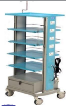
SEMS S406 MONITOR TROLLEY