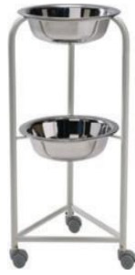
SEMS S802 BOWL STAND