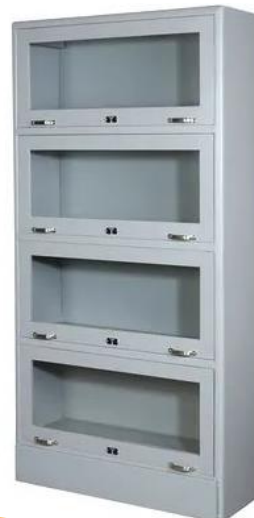
SEMS S810 BOOK SHELF