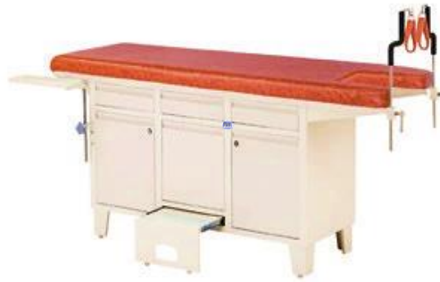
SEMS S204: Examination couch "U" cut