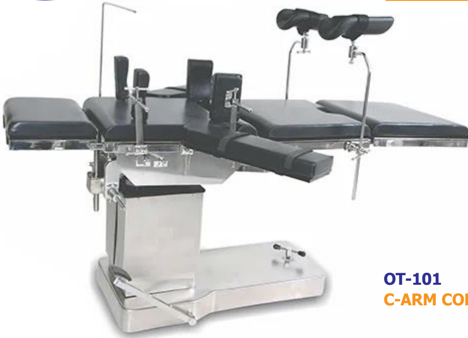
OT-101 C-ARM COMPATIBLE OT TABLE