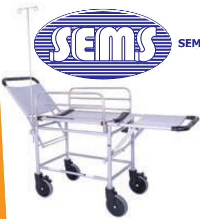
SEMS S302 FOLDING STRETCHER