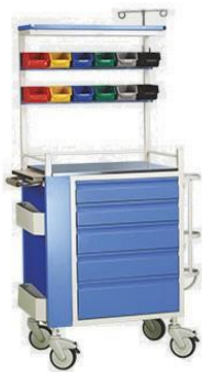
SEMS S404 MEDICINE CRASH CART CUM DRUG TROLLEY