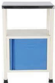
SEMS S501 NORMAL LOCKER