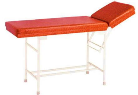
SEMS S205: Examination table