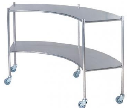
SEMS S409 C-CURVE TROLLEY