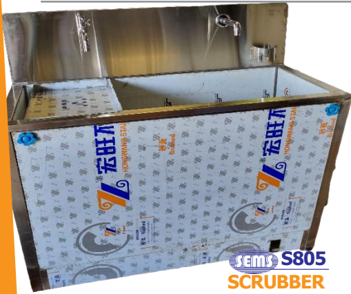
SEMS S805 SCRUBBER