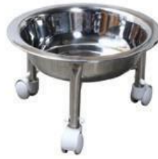
SEMS S803 KICK BUCKET