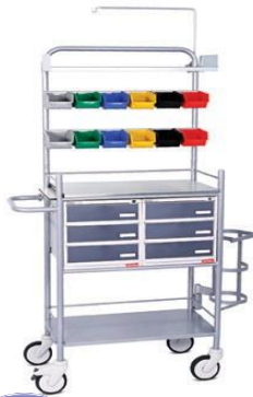
SEMS S405 MEDICINE CRASH CART