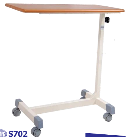
SEMS S702 OVER BED TABLE (ADJUSTABLE TOP)