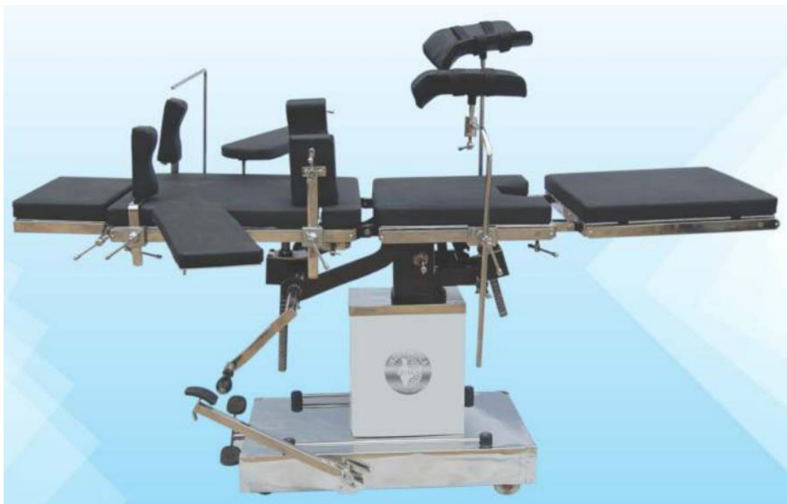
OT-102 HYDRAULIC OT TABLE