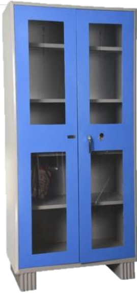
SEMS S807 ALMIRAH