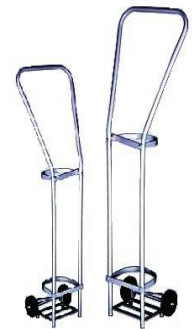
SEMS S413 CYLINDER TROLLEY