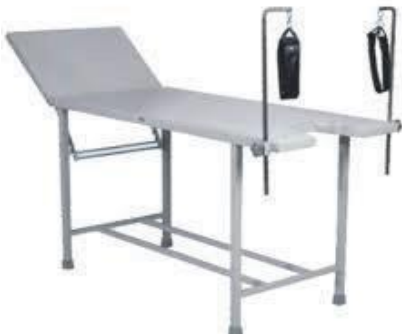
SEMS S203: Obstetrics-Gynaec table