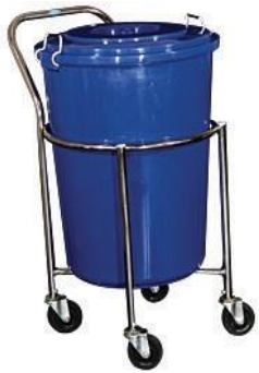
SEMS S410 SOLID LENIN TROLLEY