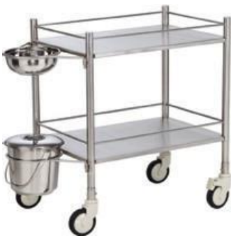
SEMS S407 DRESSING TROLLEY