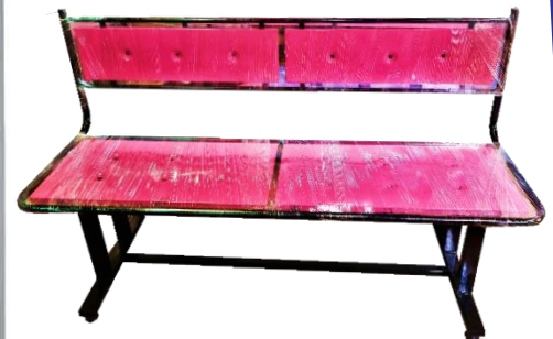
SEMS S811 LOBBY BENCH