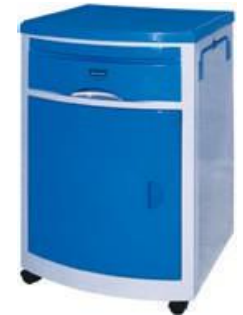
SEMS S505 PREMIUM LOCKER