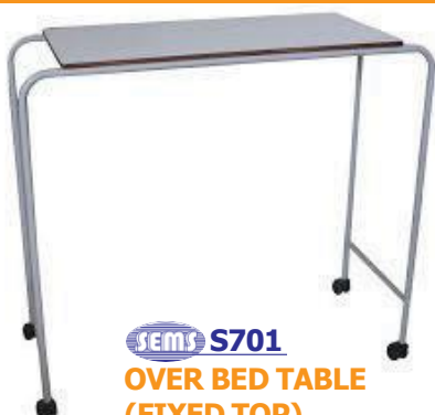
SEMS S701 OVER BED TABLE (FIXED TOP)