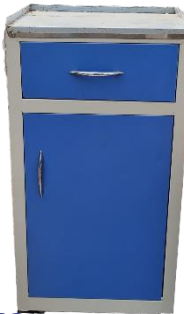
SEMS S504 DELUX LOCKER (ABS TOP)