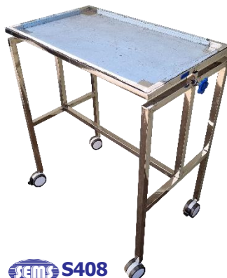
SEMS S408 MAYO TROLLEY